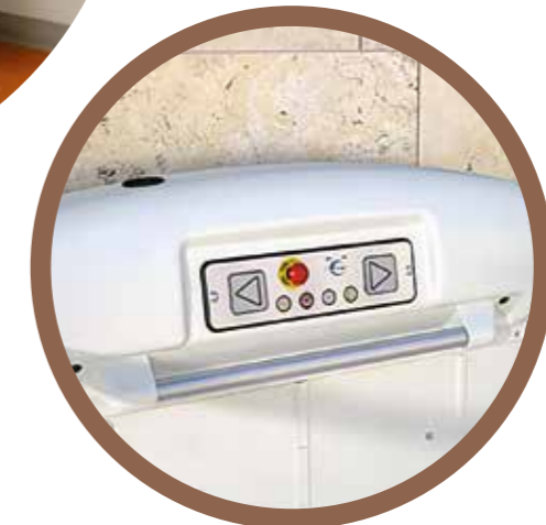
ON-BOARD CONTROL PANEL